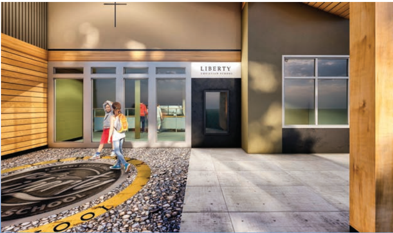
Artist rendering of potential future entrance