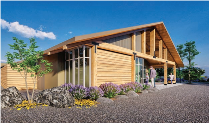
Artist rendering of LCS potential